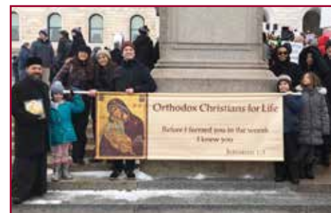
2020 ProLife March