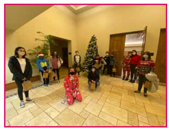
Junior GOYA Christmas Party