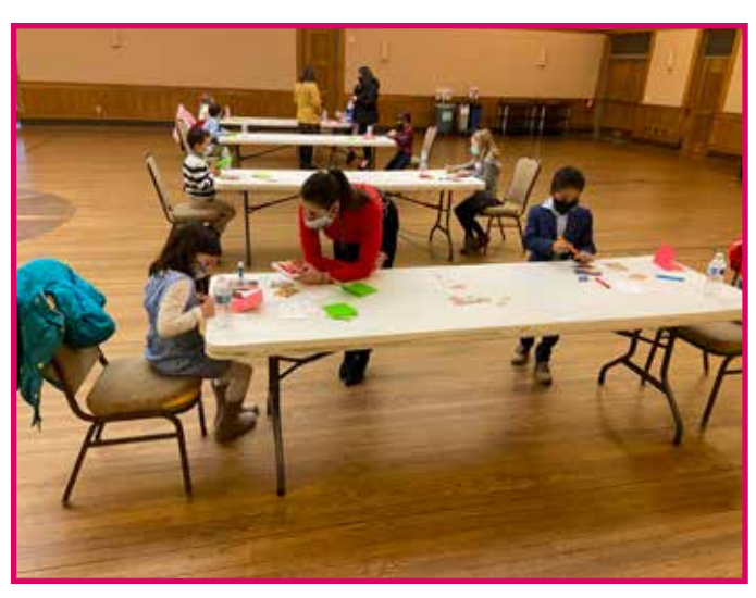
HOPE and JOY kids' activity in the Great Hall