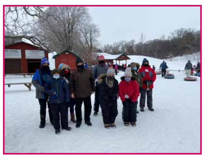
Tubing at Buck Hill in Burnsville

What a busy month! Our HOPE/JOY kids created Christmas cards for our VIPs and danced along to some Christmas songs in the Great Hall! The Junior GOYAns and Senior GOYAns each had their own Christmas party where we played Christmas Family Feud and enjoyed each other's company. We ended the year by tubing at Buck Hill. Looking forward to 2021!