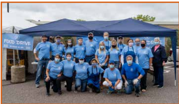
The Big Greek Give Back Crew.

Thank you again for your great generosity and concern for the well-being of others!