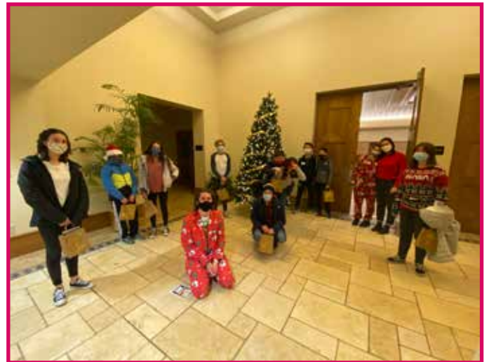
Junior GOYA Christmas Party