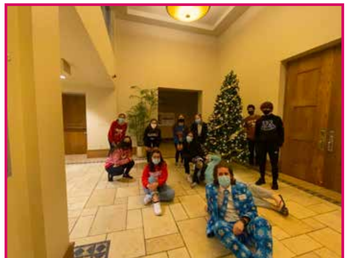
Senior GOYA Christmas Party