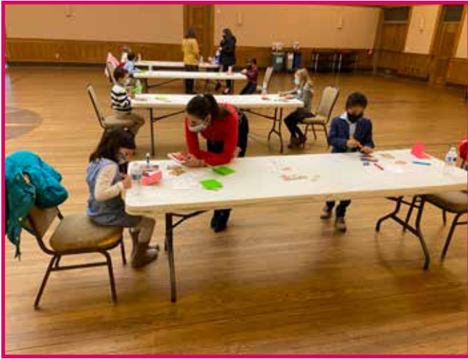
HOPE and JOY kids' activity in the Great Hall