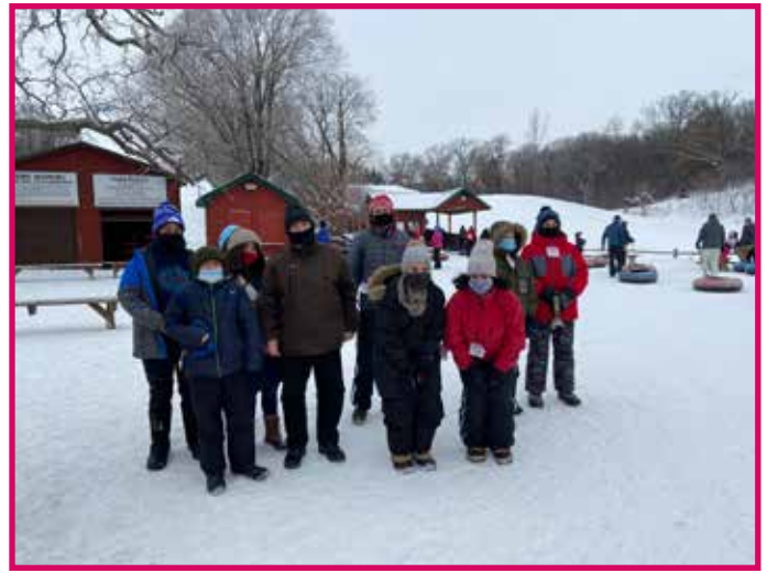
Tubing at Buck Hill in Burnsville

What a busy month! Our HOPE/JOY kids created Christmas cards for our VIPs and danced along to some Christmas songs in the Great Hall! The Junior GOYAns and Senior GOYAns each had their own Christmas party where we played Christmas Family Feud and enjoyed each other's company. We ended the year by tubing at Buck Hill. Looking forward to 2021!