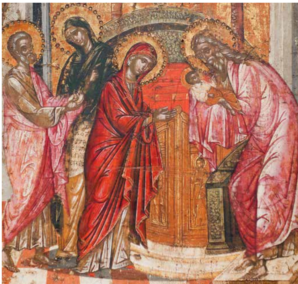
Presentation of Christ in the Temple - 17th century in Meteora, Greece

—From the Kontakion of Presentation of Our Lord