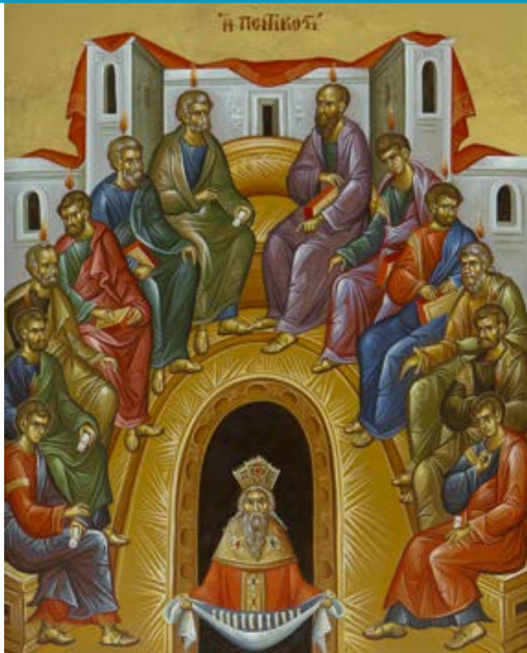
The feast of Holy Pentecost is on Sunday, May 31.